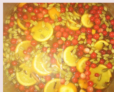
mulled apple cider on the stove

involved. That's why we thank all of our suppliers who also stay for lunch or take a delicious snack for the road. Using as many local and responsible sources as possible can have a positive impact on our environment. Using recyclable products helps us to reduce our waste and we are currently looking into using post-recycled plastics for some of our take-out products. Pending a well thought-out decision process we would love to integrate these 'greener' products. Locally sourcing as many goods as possible decreases our carbon footprint. The environmental damage which can occur in the transportation of goods is something we are well aware of and therefore sourcing our products from local suppliers and purveyors can go a long way towards reducing our